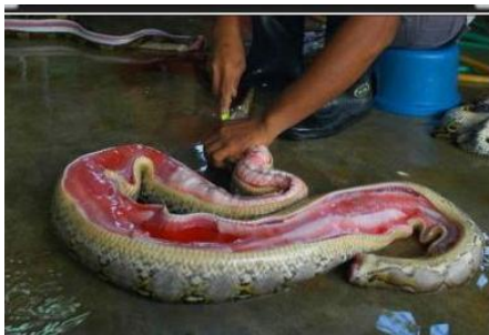
A man cutting up a snake

Creative inspiration often appears in the dreams of body and mind relaxation. Because the cerebral cortex center may form some temporary contacts that awake unexpectedly formed, get rid of the ties of logical thinking and social prejudice, so the dream can obtain the achievements of thinking and for inventions.